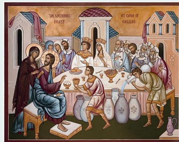
Wedding Feast at Cana

Stevens Point Deanery Marriage Preparation